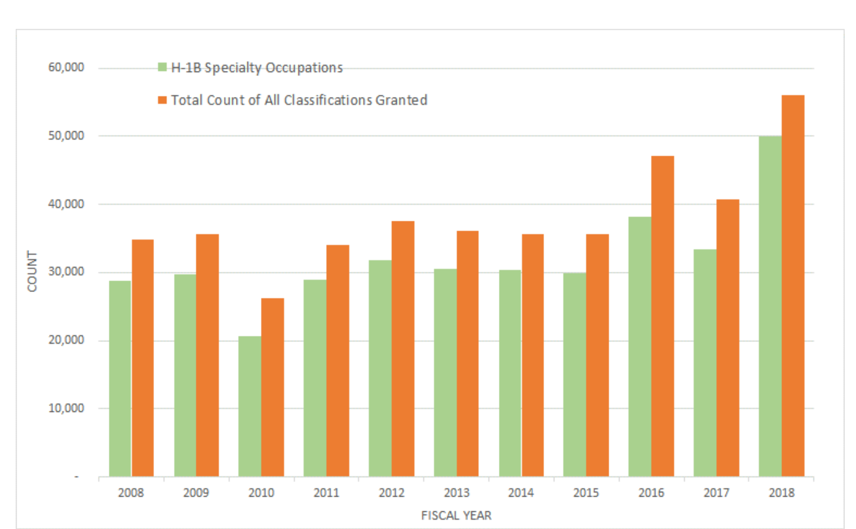
Figure 2: F-1 Students Obtaining Another Nonimmigrant Classification: H-1B Count vs. Overall Count