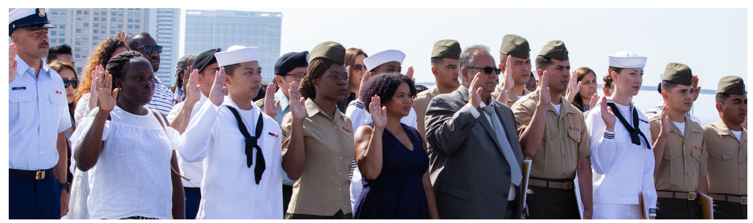
Taking the Oath of Allegiance at a naturalization ceremony on the U.S.S. Midway, San Diego, CA.

When you take the Oath of Allegiance at your naturalization ceremony, you make several important promises of loyalty to the United States. Loyalty means showing consistent support to something or someone. At your naturalization ceremony, you will raise your right hand and say the Oath. After the Oath, you become a U.S. citizen. As a new citizen, you have new responsibilities and duties that you promised in the Oath.